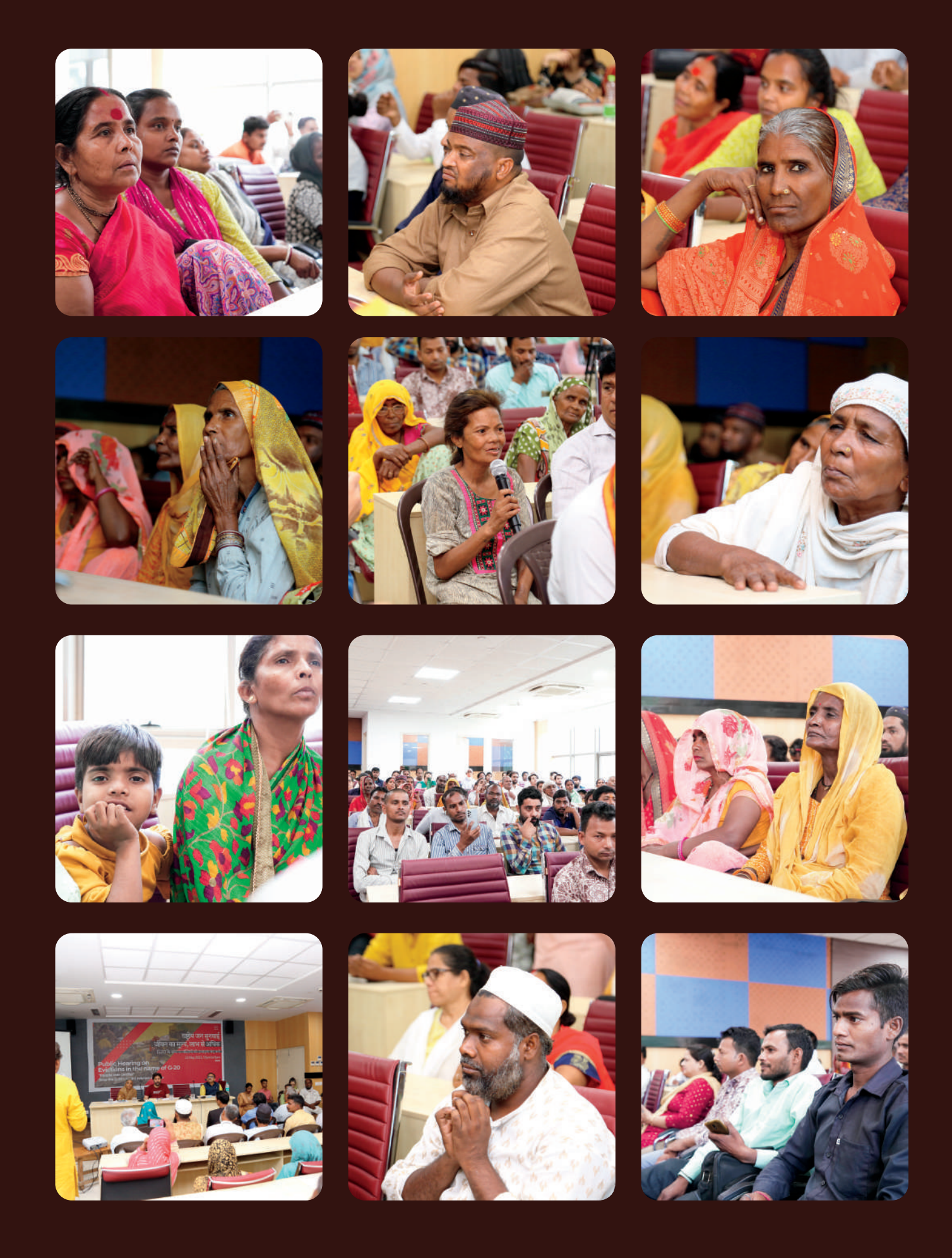
Public Hearing on The Forced Evictions Across India and G20 Events: A Report by Concerned Citizens